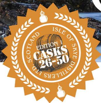
IMAGE: The Cuillin Hills